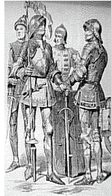
Art from Badger's Medieval Clipart Page

Shire of Dregate Wilds of Inlands Kingdom of An Tir